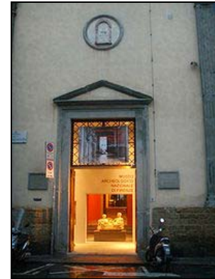
The Museum Entrance

Guided visit to the Archaeological Museum of Florence and to the Phoenician section of the deposits of the Museum.